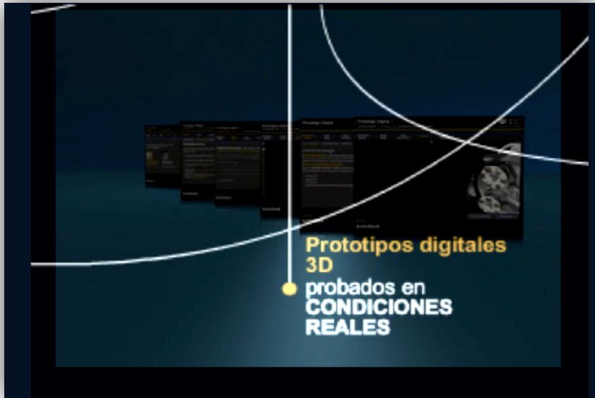
Content MKT Microsite + Video + White Paper